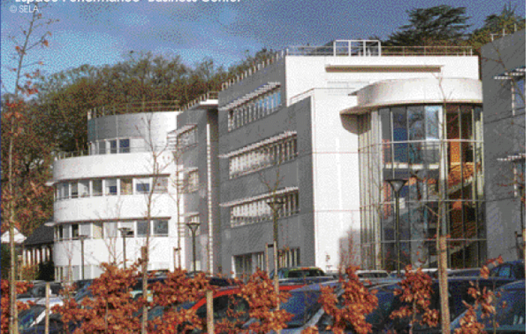
"Espace Performance" Business Center